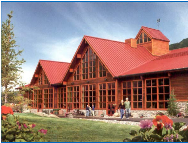
Denali Princess Lodge