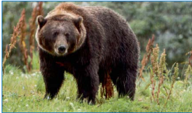
Wildlife viewing in Denali National Park