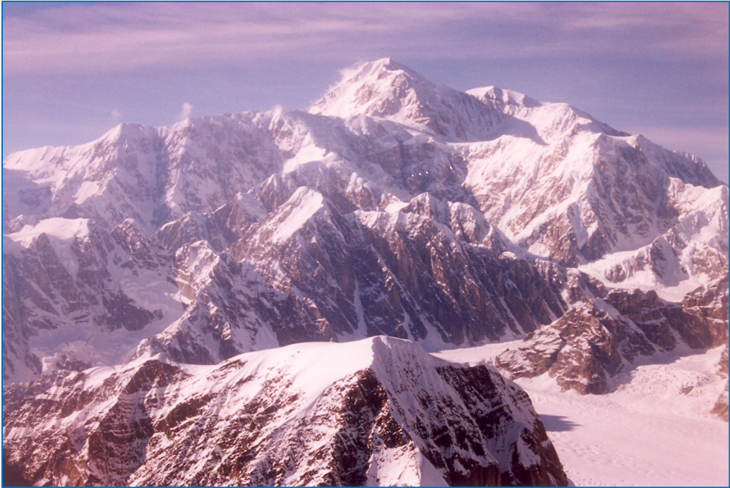
Mount McKinley (Denali)