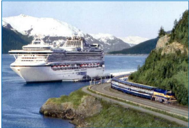
Enjoy beautiful scenery by ship and rail